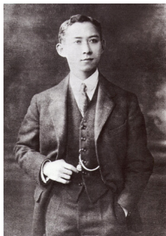
His Royal Highness Prince Mahidol Of Songkla